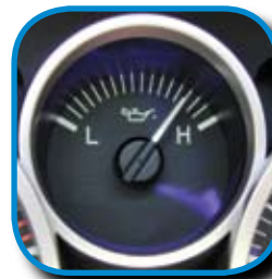
At Higher RPMs, Needle May Reach This Mark Or Higher