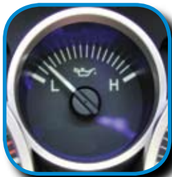
At Idle, Needle May Drop To This Mark Or Lower

In between idle and 3000 RPM, the needle will fluctuate steadily with engine RPM. Oil pressure specification is 337-591 kPa (49.0-85.8 psi) at 3,000 RPM with oil temperature at 100°C (212°F). This condition is normal for the 2006 MX-5 and does not require repair.